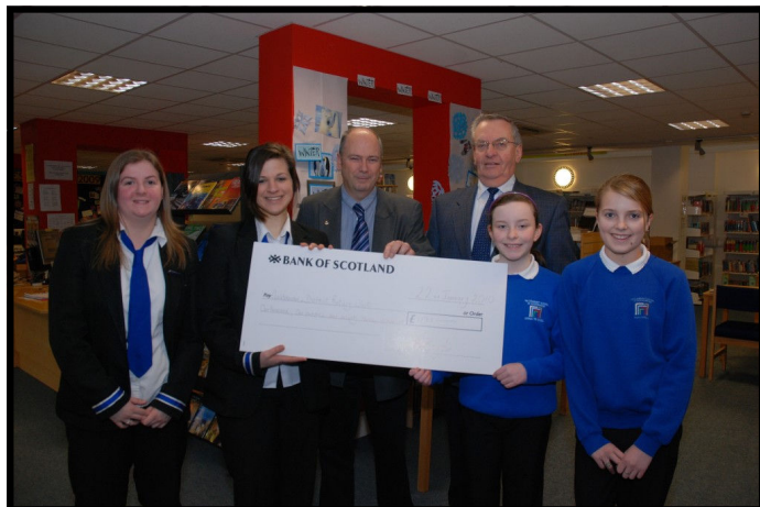
Pupils presenting cheque to members of the Auchterarder & District Rotary Club.